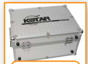
Carry Case (Included)